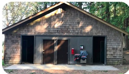
Individual Toilet & Shower Stalls