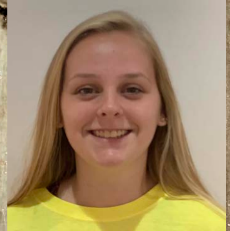
Olive- Grizzly Bears