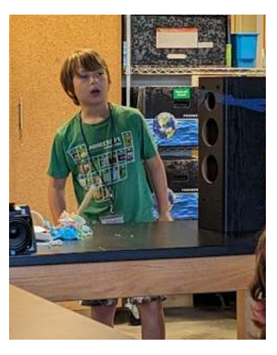
Turning an old speaker into a drum