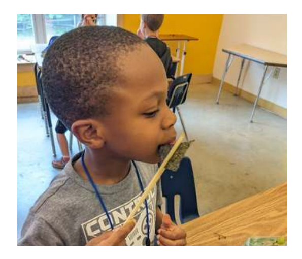
Campers were tasked with eating their lunch with their newfound chopstick skills