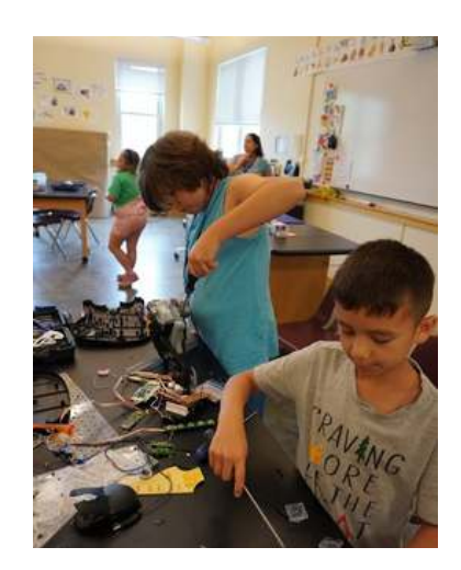
Using tools to safely take apart the toys at camp

In this camp activity, campers were instructed to take apart household objects and toys with as much destruction as they pleased as long as safety goggles were on and they were using reasonable force on their objects.