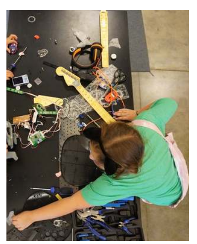
Many toys are equipped with circuitry, and it's interesting to figure out how they might work

Sometimes, the best way to understand something is to take it apart, and these campers enjoyed upcycling their parts into an electronic band!