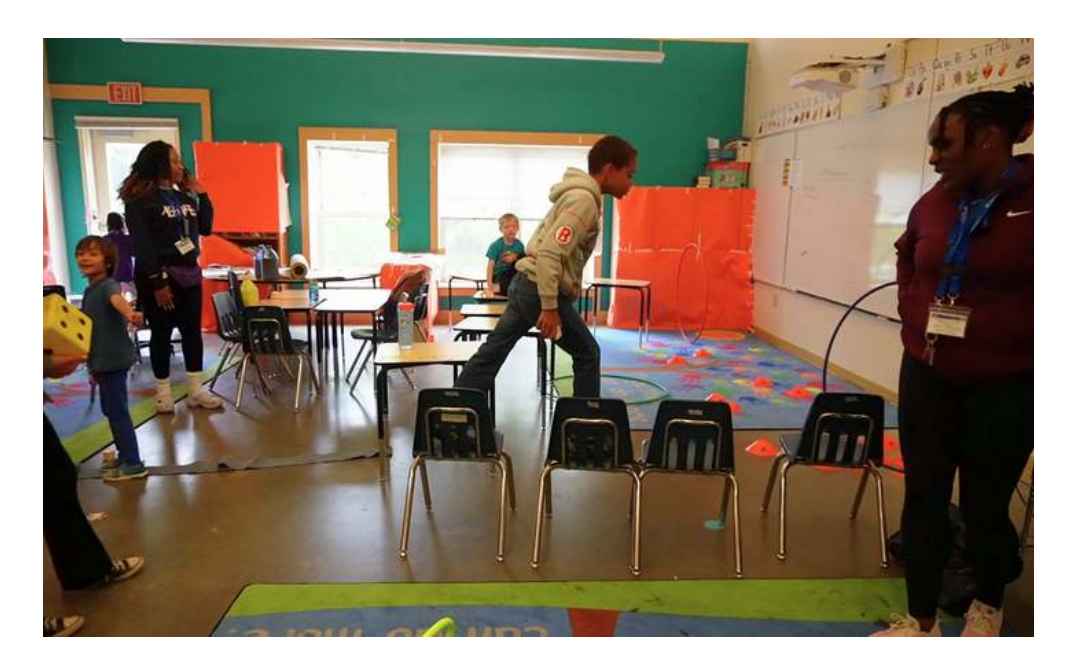
Walking on chairs to practice our balance